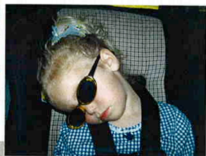
What we all have felt like!