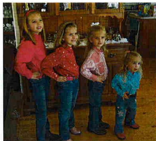
Have you ever seen a more rowdy bunch of cowgirls?