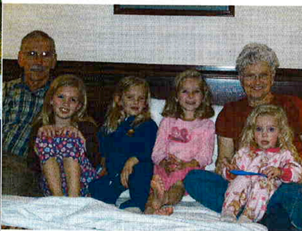
The last night in a Denver Hotel room before returning.