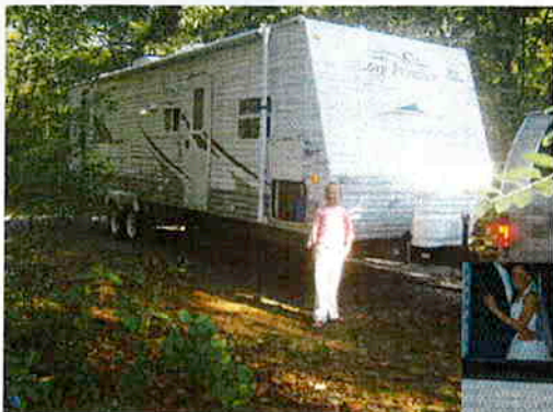
The first campground we stayed at in Tennessee.

PS. If you did not see us this go around and would like to the next time, just let us know. This furlough was only half as long as the last one so we hope to see those we missed this time on the next one!