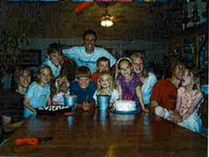
More cousins than you know what to do with.